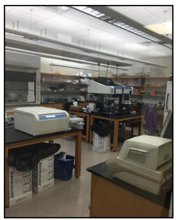
Figure 4. One of the Reich Lab spaces where samples are analyzed.