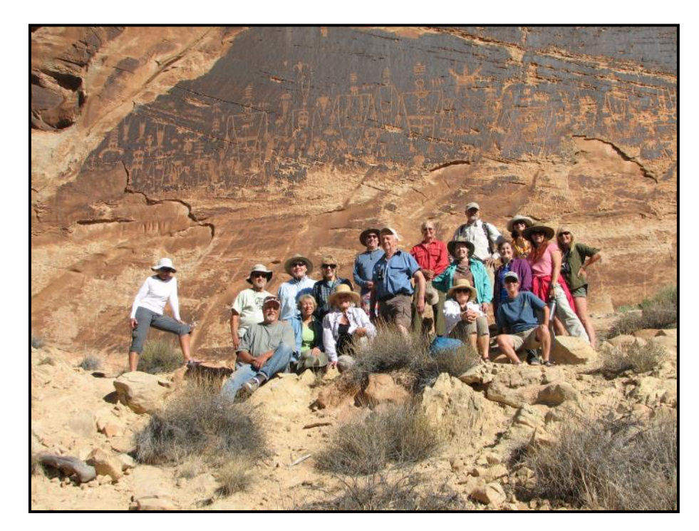
IPCAS Group Photo at Kachina rock art panel, accessed by river raft.

Be sure to send in your registration now for the CAS annual meeting at History Colorado in Denver on October 28. The Denver Chapter has a full slate of speakers scheduled on Saturday with field trips