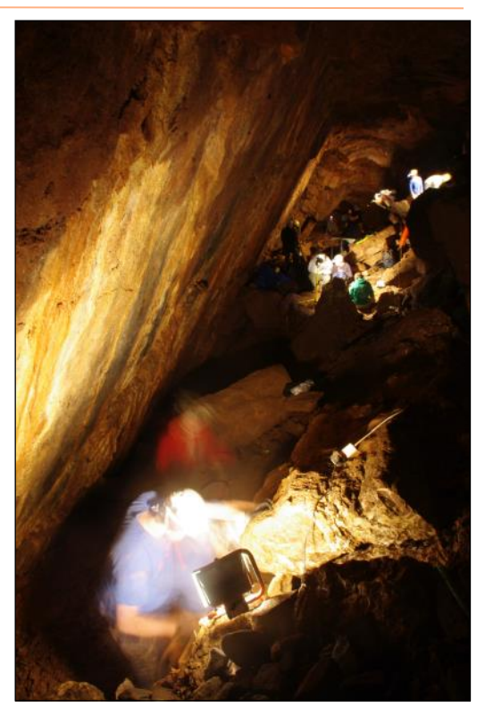
Read's Cavern.

The two presenters will discuss the results and conclusions from excavations they conducted at Read's Cavern during April and May 2010. The possible uses of the cave have been reconsidered through comparisons to activities taking place at other Iron Age sites around Britain, including other cave sites. The defining aspect of Read's Cavern as a space is its lack of visibility, as both a feature in the landscape and as a place in which it was difficult to penetrate the darkness. Concepts of contamination and cleanliness may have had an important role in forming the intricately structured deposits within Read's Cavern.