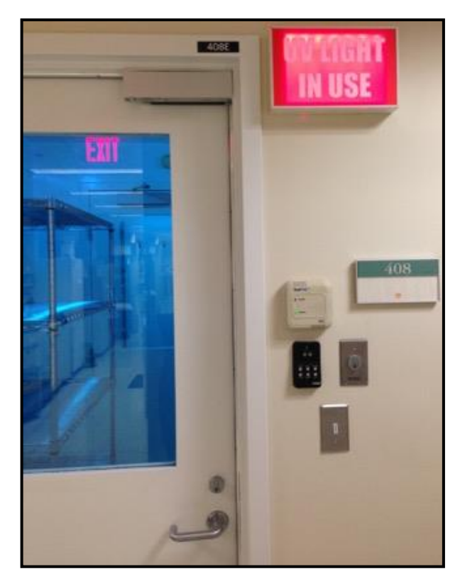
Figure 1: One of the Reich Lab's processing rooms. UV light is used to destroy modern DNA, which could contaminate ancient samples.

Ancient DNA research is truly a collaborative process—no single person could ever complete all the required analysis alone. The first step in the process is identifying interesting samples to study. This could be through an archaeologist contacting the lab and requesting to have samples analyzed, or the lab developing a research question and then identifying the samples needed to address the question. I am most involved with these first steps; along with helping identify samples, I serve as an "interpreter" between archaeologists, geneticists, and the institutions that curate osteological remains.