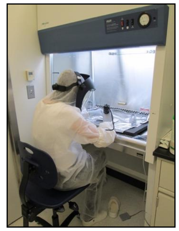
Figure 2. One of the Reich Lab technicians processing a sample. Technicians wear body suits and a facemask to avoid contaminating ancient samples.

It seems as if almost every month a paper is published that uses aDNA to help create a better understanding of the past. Ancient DNA research has confirmed previous archaeological findings, and made multiple unexpected discoveries. However, there have been some concerns, particularly ethical concerns, raised about these studies.