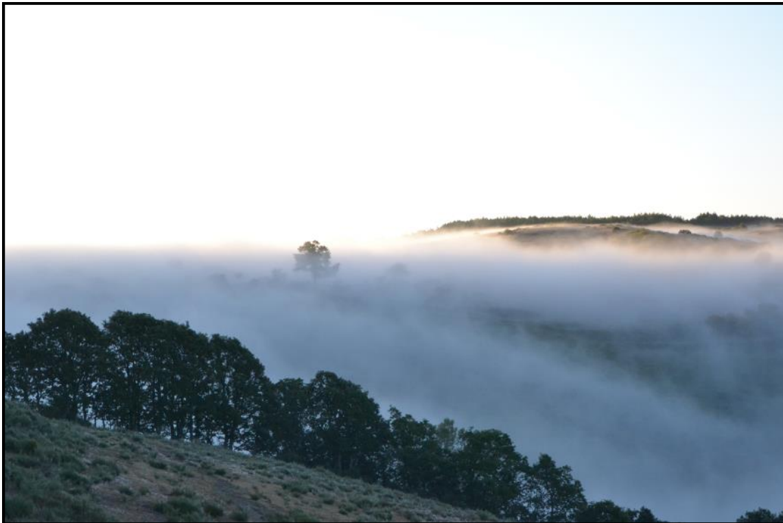
On the way to St. James along the Camino Frances.

I am so very glad to have gotten to be with you this last year. It has helped me to consider my career and get ready for this next stage. I'll stay in touch and you may see me around for the next few months as we are back and forth to Boulder getting ready for our migration. As we move I will try to take my cues from my studies of the Ancestral Pueblo migrations of the tenth and thirteenth centuries and try to blend into the population once we find our next center place. I hope to see you down the path in the future. I will let you know where I land. Buen camino amigos!