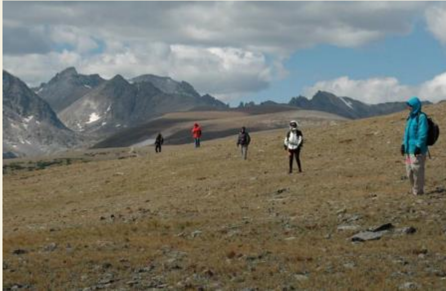
Survey on Niwot Ridge, Paleocultural Research Group September 2014