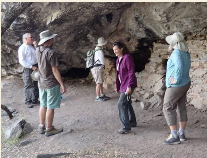
Gila Cliff Dwellings