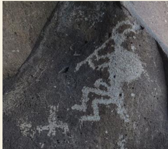
Fluteplayer at La Cieneguilla Petroglyph site