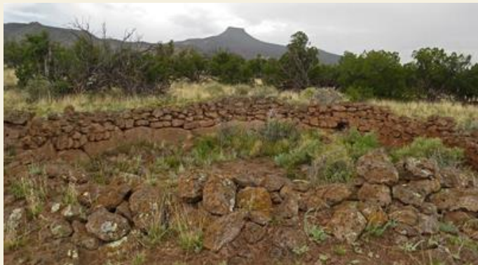
Tsi-p'in-owingeheh kiva with Cerro Pedernal in background