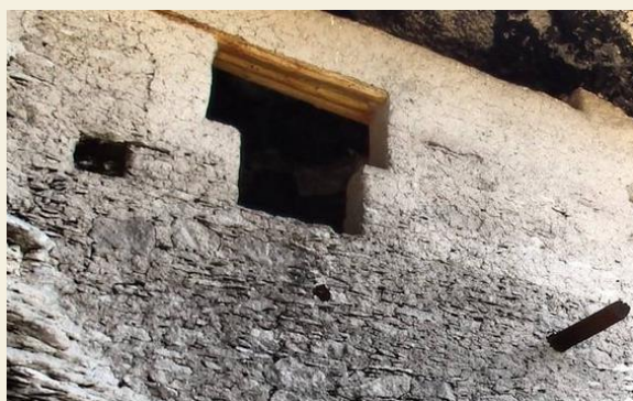
'T' shaped door at Gila Cliff Dwellings