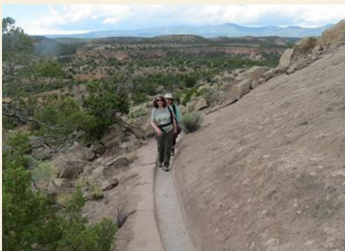
Tsankawi pueblo trails worn into the rock