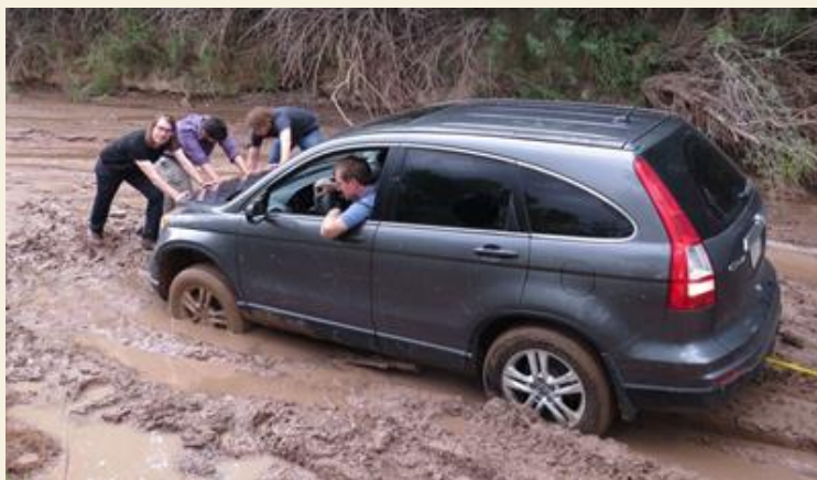
Getting stuck on the way to Cuyamungue Pueblo Ruin

For more photos and information on what we did on this field trip go to http://www.coloradoarchaeology.org/BULLETINBOARD/pueblos-field-trip-2015/Northern-Pueblos-Field-Trip-June%206-15-2015.pdf