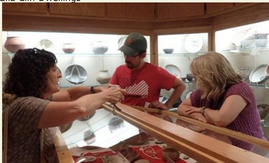
Luna County Museum, Deming New Mexico