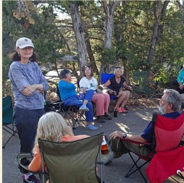
Socializing in the campground