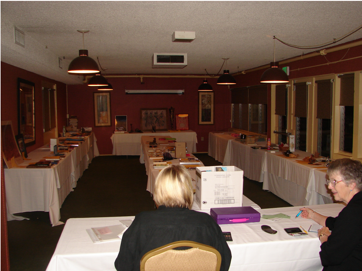
Silent Auction Room