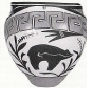
Loretta Joe - Courtesy of Enchanted Village

Bio sketch photos reprinted from Southern Pueblo Pottery: 2,000 Artist Biographies by Gregory Schaaf