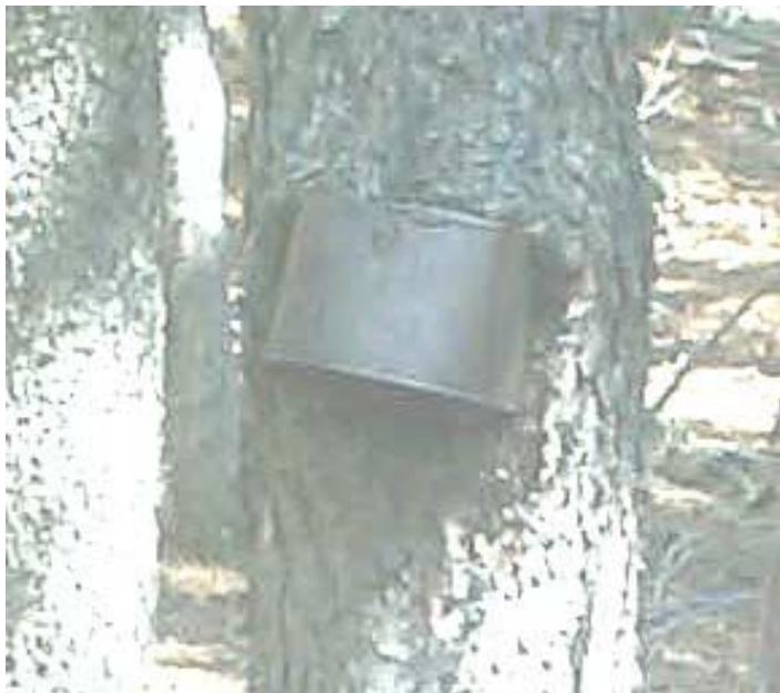
What is the function of this can-in-a -tree?

Park archaeological staff has found two of these features in Rocky Mountain National Park, and are stumped about how these were used. This is a tuna-fish can sized can (3 or 4 inches in diameter, 2 inches tall), top removed, attached to a tree, and located 25 to 28 inches off the ground. We don't know how they are attached to the trees because bark has overgrown them, thus we know they have been attached for a long time. One can is associated with a pre-1932 road graded area and gate. The other can is in the vicinity of a pre-1915 portable sawmill site. Both are attached to lodgepole pine trees about 4 to 6 inches in diameter, in an area of thick lodgepole pine forests. If you know what function these cans served attached to the tree, please contact Lisa Hanson at Rocky Mountain National Park ( lisa_hanson@nps.gov ) or 970-586-1228.