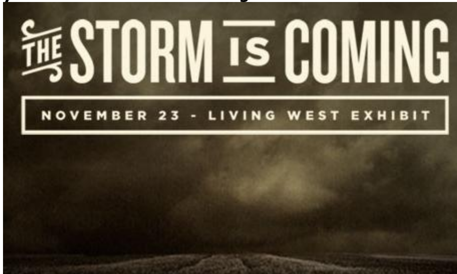
Exhibit Opening Date: November 23, 2013

Location: History Colorado, 1200 Broadway, Denver Colorado