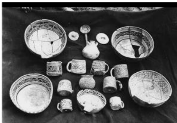
Pottery from Mesa Verde

The Mesa Verde portion of the exhibit shows the legacy of the Early Archaeological Collections at History Colorado. Explore life in Mesa Verde and see History Colorado's renowned collections of ceramics, basketry, perishable artifacts and other archaeological finds from Mesa Verde.