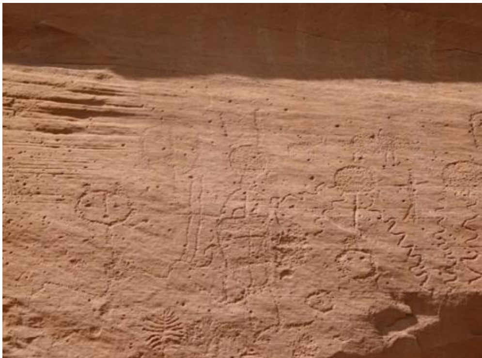
Upper Sand Island Rock Art