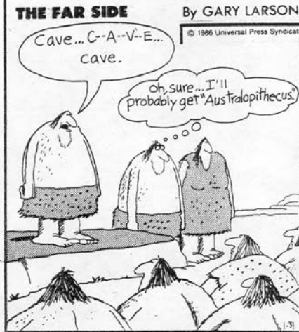
Primitive spelling bees

A new CAS Chapter is in the process of organizing in Ft. Collins. Lots of good luck from the Lyons Chapter. We will be waiting to hear your Chapter name and to receive a roster of officers. A copy of the March Calumet is being mailed to the Chapter Librarian as a welcome to the ranks of our Colorado Archaeological Society. Let us hear from you.